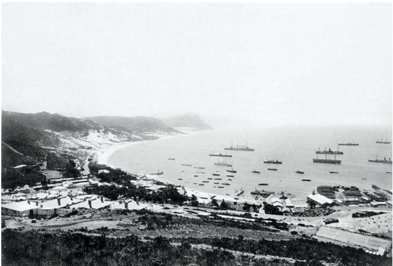
The Naval base in Simon's Town 1900