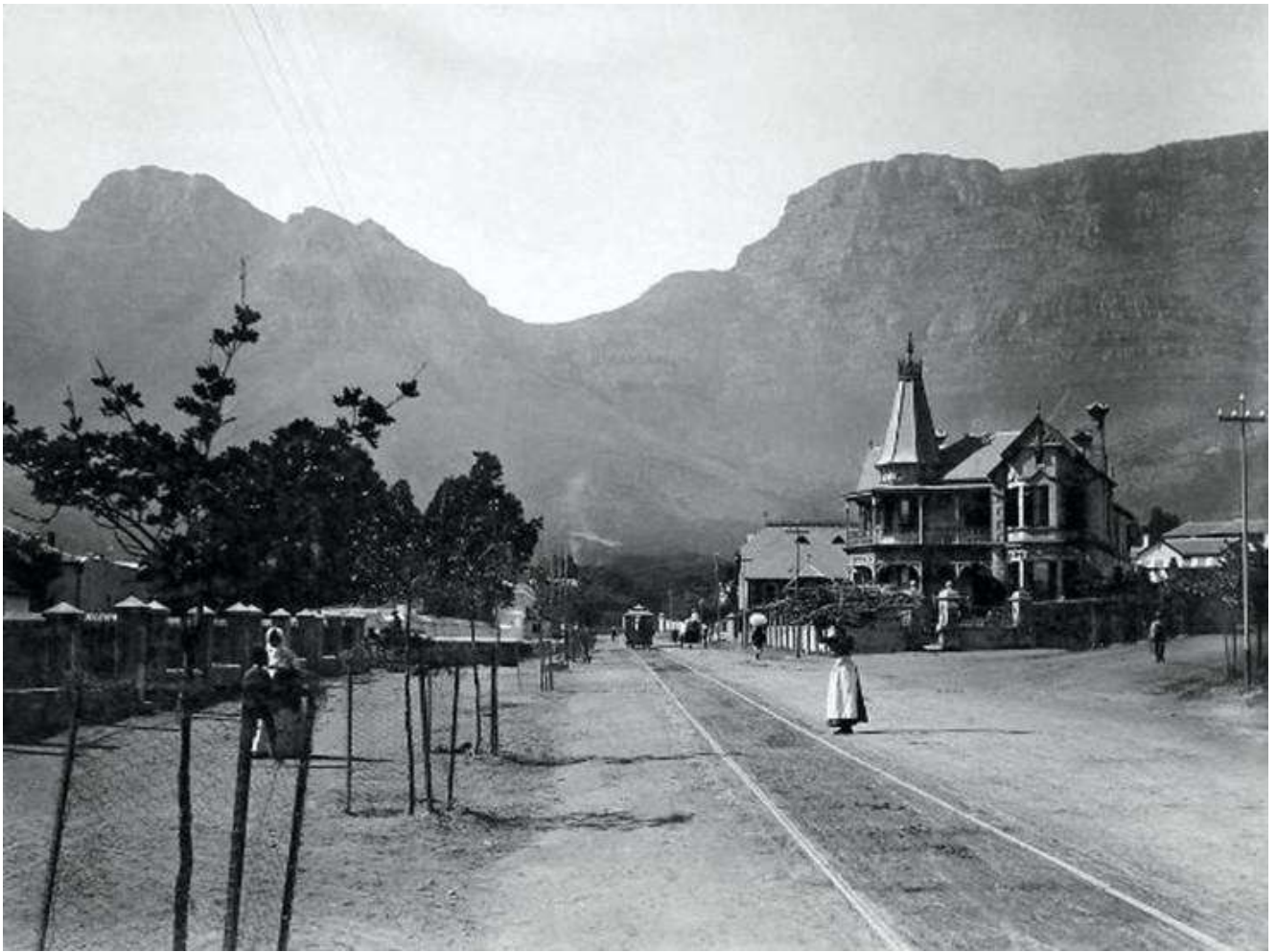
Orange Street, Cape Town 1870