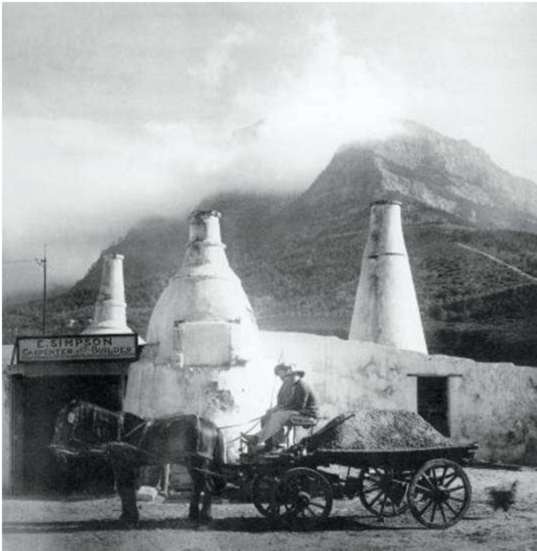
The Lime kilns in Mowbray in 1910, with Table Mountain in the background.