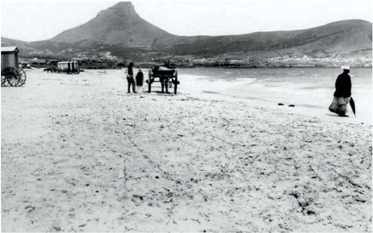
The beach that used to be in Woodstock . This photo was taken in 1899.