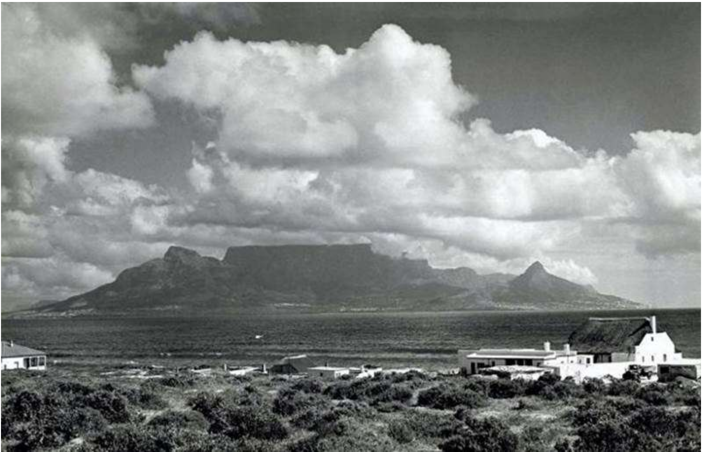
The view from Blouberg in 1950.