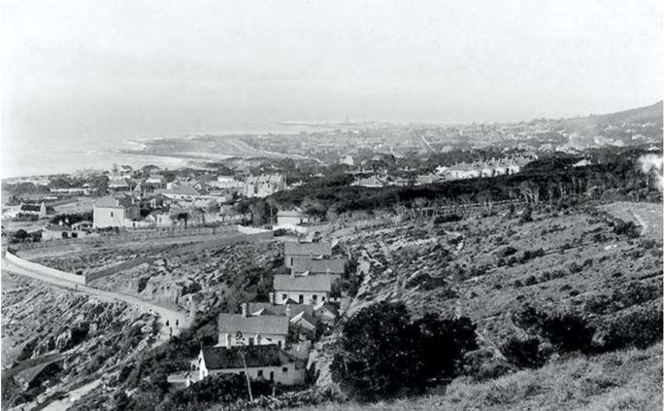
Sea Point 1890